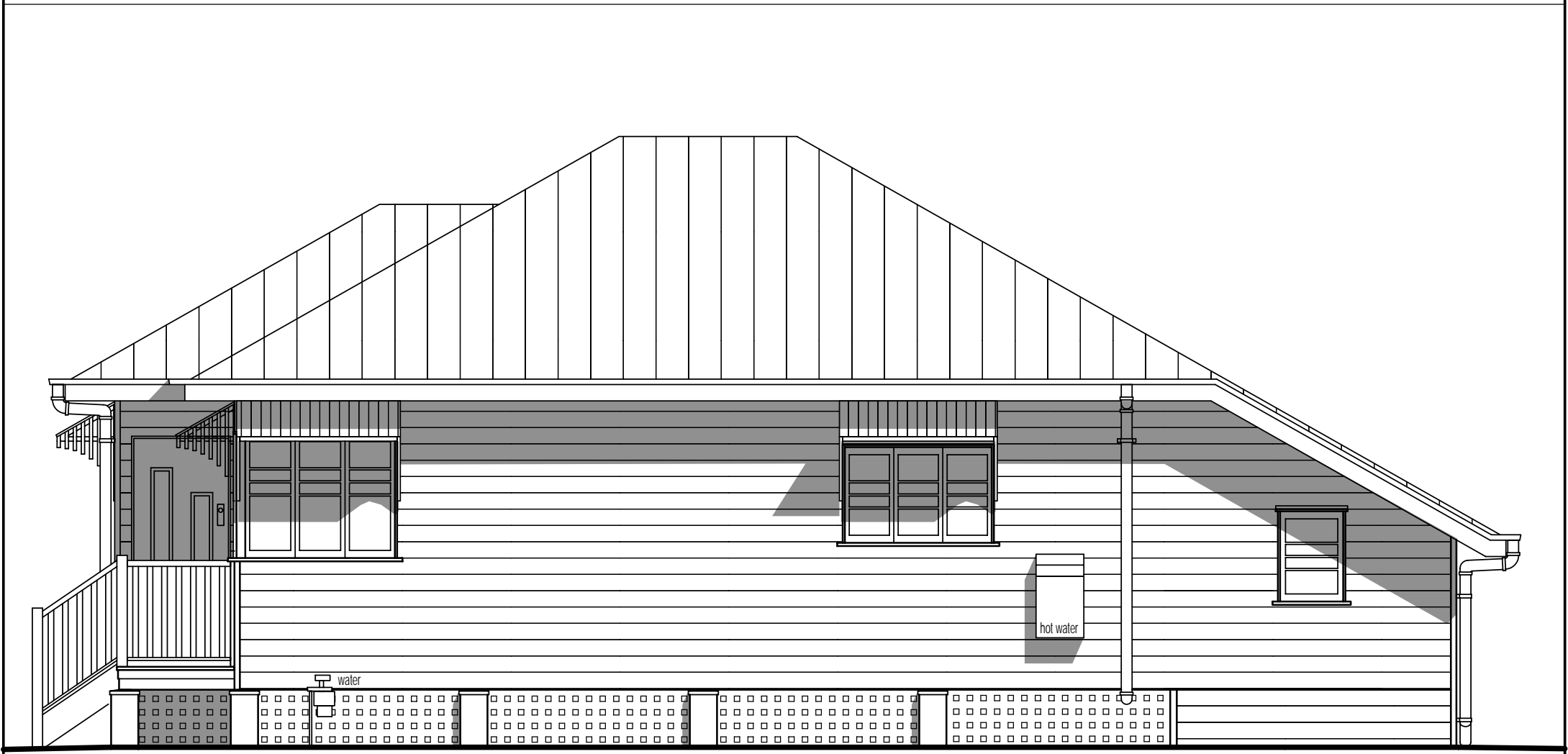
Elevation North - M 1:50